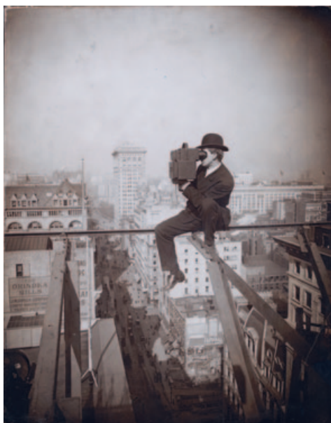
Underwood and Underwood (American, active 1880–1934) Above Fifth Avenue, Looking North 1905. Gelatin silver print, 9 1/2 x 7 5/16 inches (24.2 x 18.6 centimetres). The Museum of Modern Art, New York. The New York Times Collection.

P icturing New York is the second exhibition of the exclusive partnership between the Art Gallery of WA and The Museum of Modern Art in New York.