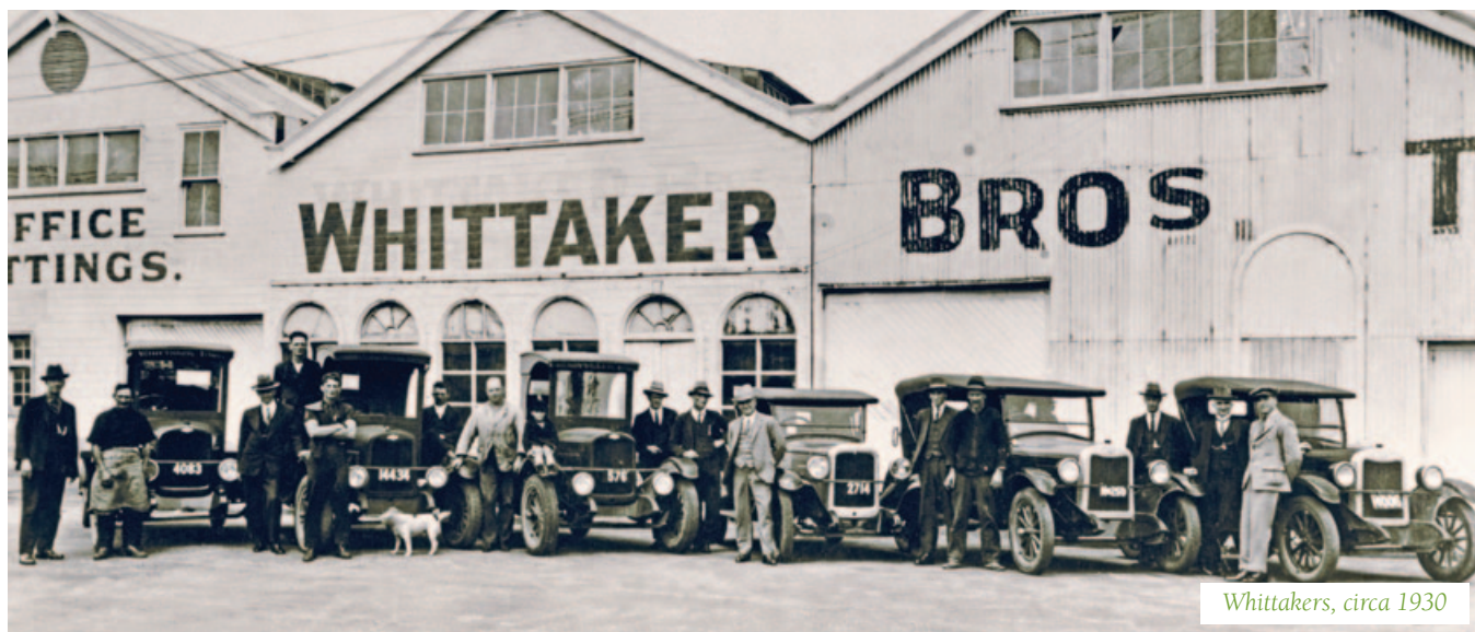
Whittakers, circa 1930

Take a stroll and learn about Subiaco's history during a ninety-minute guided walk. Hardware stores played an important part in the early development of the area and they say 'Subiaco was built on a Sunday'. Many earlier residents built their homes with pre-cut timbers purchased from the local timber/hardware merchant.