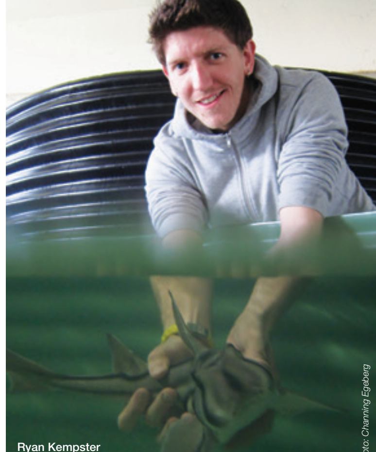
PhD scholar and marine neuroecologist, Oceans Institute

Studies have shown what happens to ocean ecosystems without sharks. Fisheries shut down due to increases in normal prey species which decimate commercial stocks. Coral abundance declines and is replaced by macroalgae. Species diversity declines. Ecological chain reactions are set in motion which cannot be undone. We should fear a world without sharks far more than one with them.